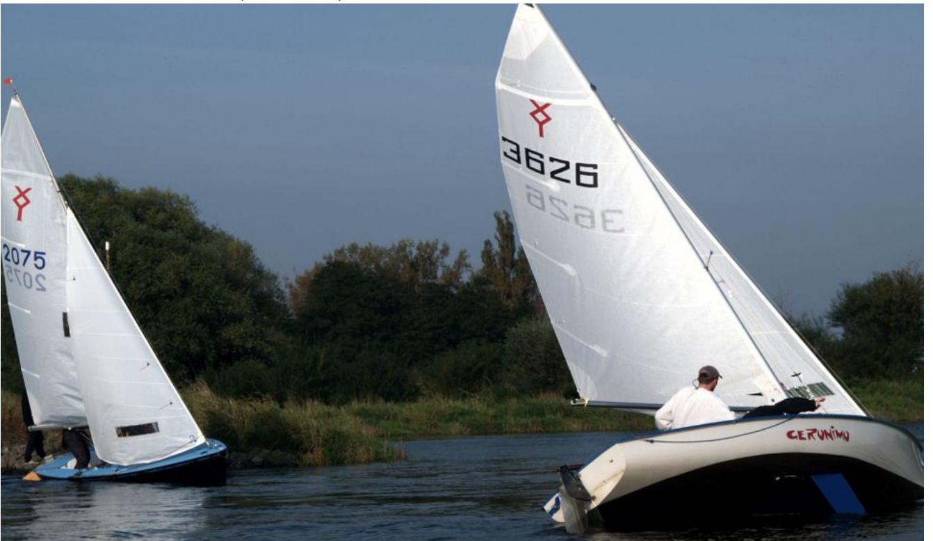
« Zurück Segeln auf der Elbe (Bild 5 von 15) » Vorwärts