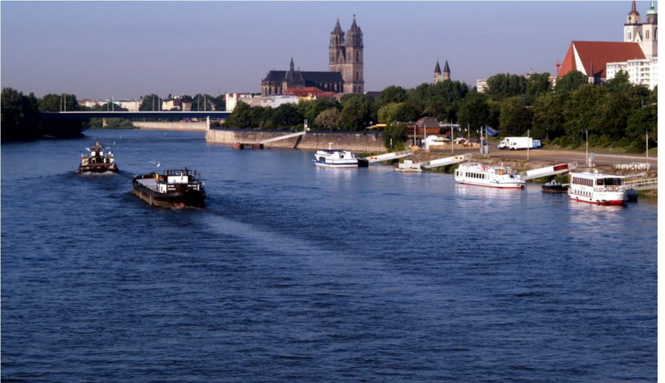
« Zurück Elbe (Bild 2 von 15) » Vorwärts