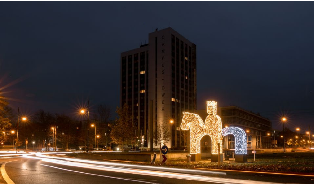
« Zurück Campustower am Uniplatz (Bild 15 von 15) »