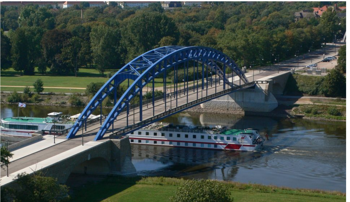
« Zurück Sternbrücke (Bild 3 von 15) » Vorwärts