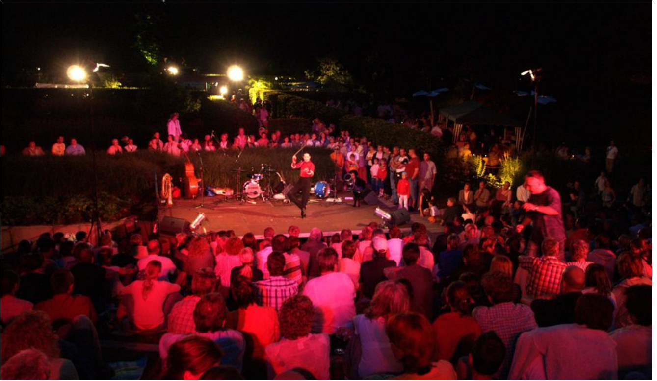
« Zurück Nordpark - Studierendenfest (Bild 8 von 15) » Vorwärts