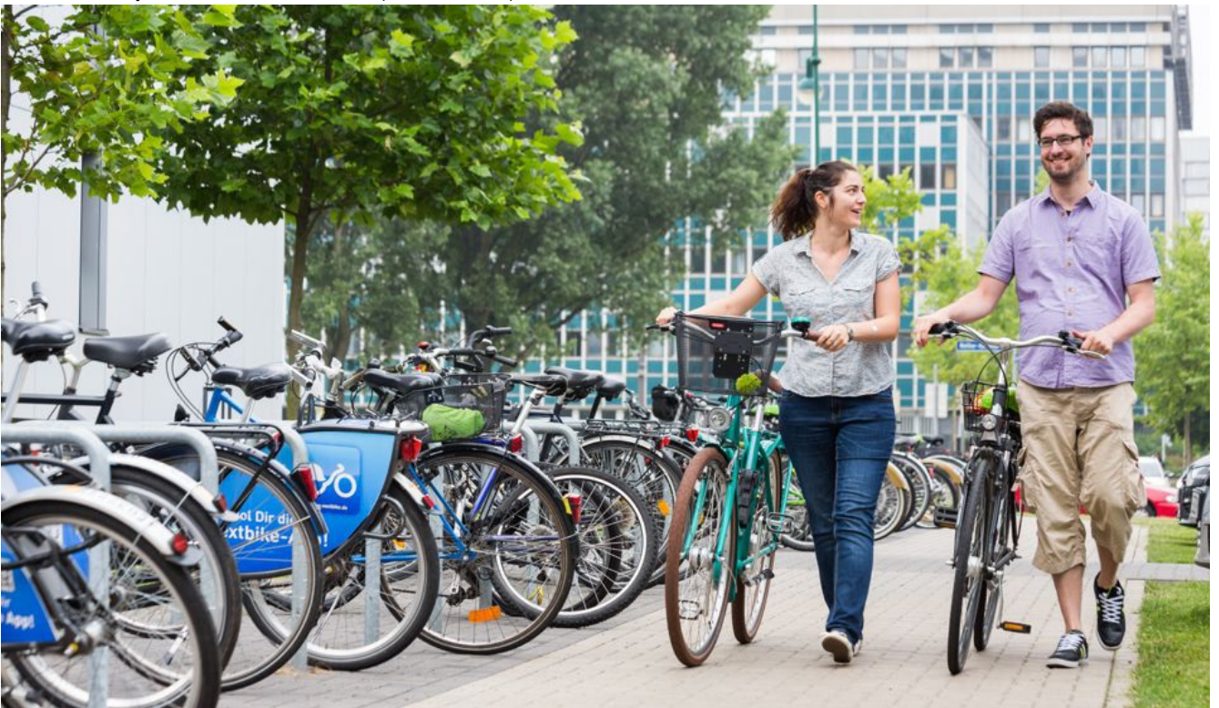
« Zurück Mit dem Fahrrad unterwegs (Bild 9 von 15) » Vorwärts