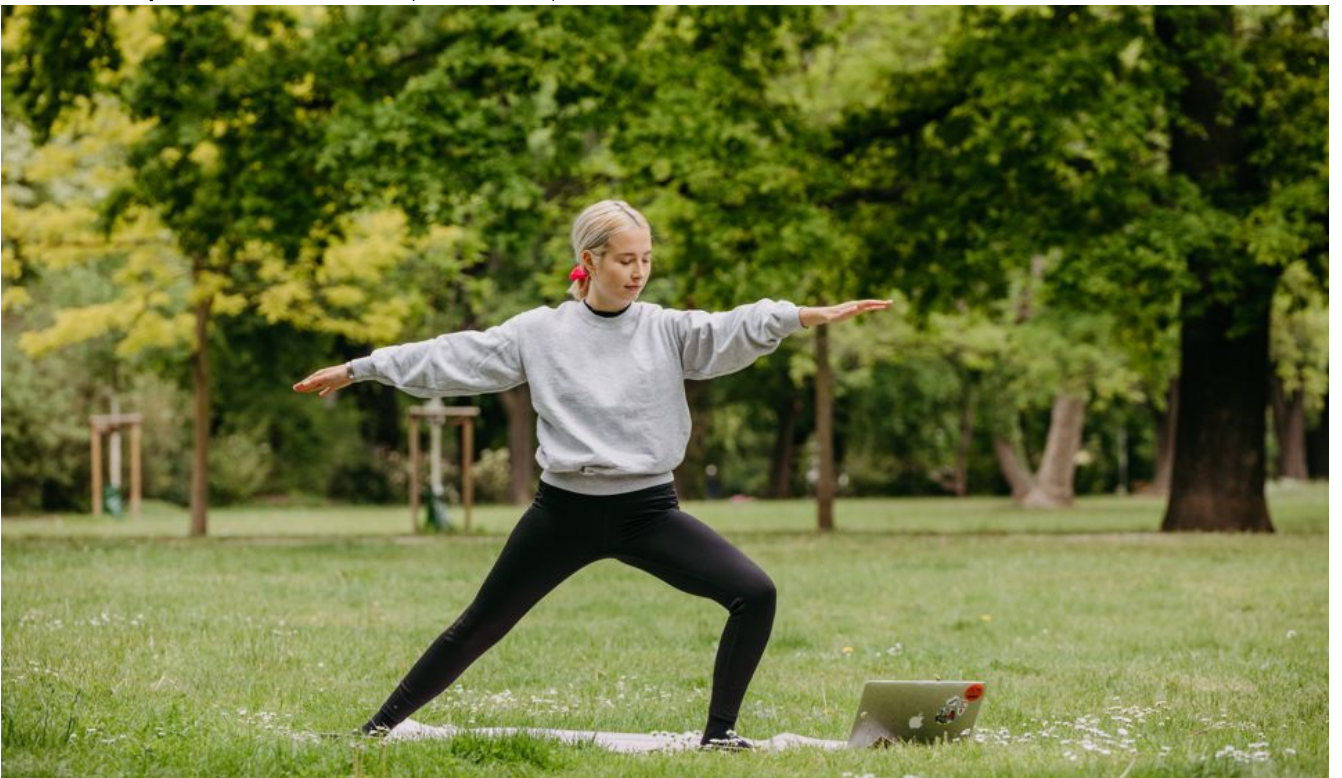
« ZurückYoga im Nordpark (Bild 7 von 15) » Vorwärts