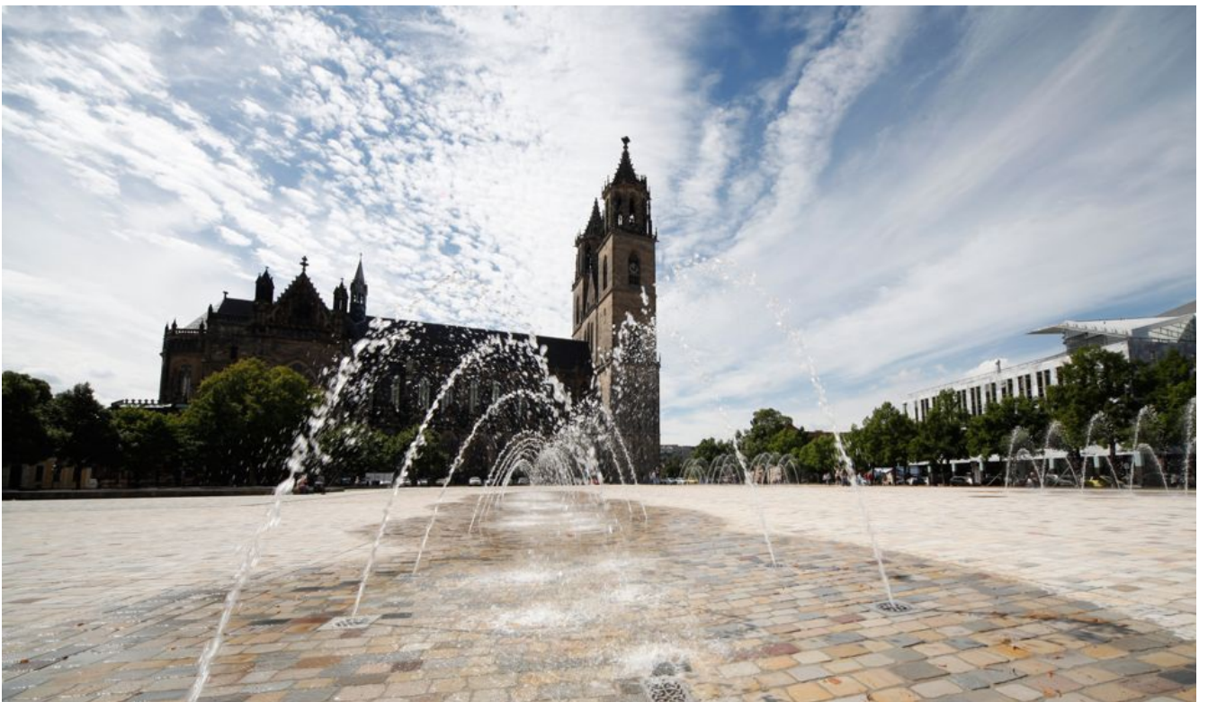
Domplatz (Bild 1 von 15) » Vorwärts