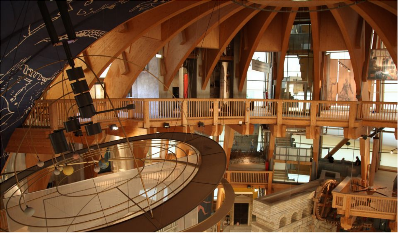
« ZurückIm Jahrtausendturm (Bild 10 von 15)» Vorwärts