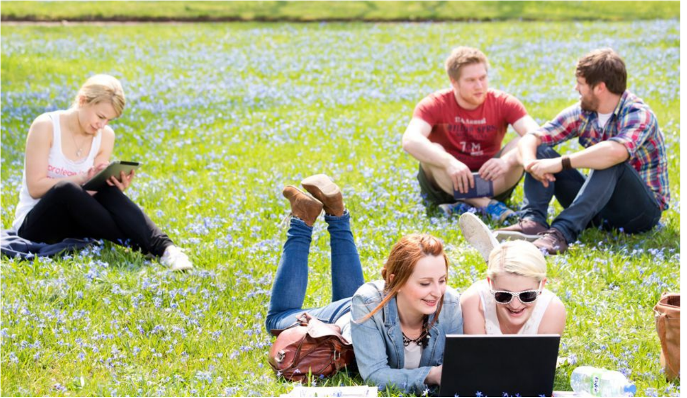
« ZurückNordpark - direkt an der Uni (Bild 6 von 15) » Vorwärts