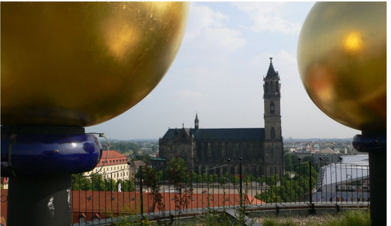
« Zurück Vom Hundertwasserhaus geblickt (Bild 13 von 15) » Vorwärts