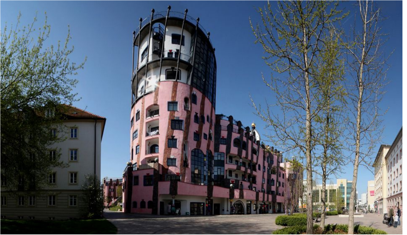
« Zurück Hundertwasserhaus (Bild 12 von 15) » Vorwärts