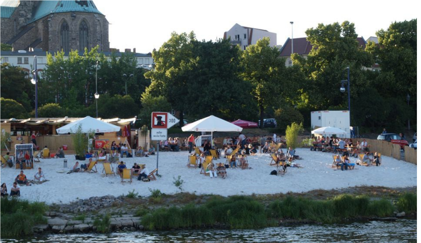
« Zurück Strandbar an der Elbe (Bild 4 von 15) » Vorwärts