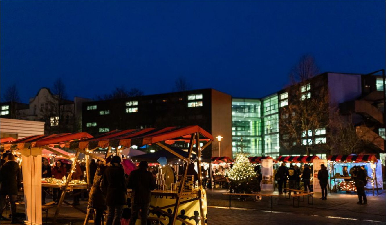
« Zurück Uni-Weihnachtsmarkt (Bild 14 von 15) » Vorwärts