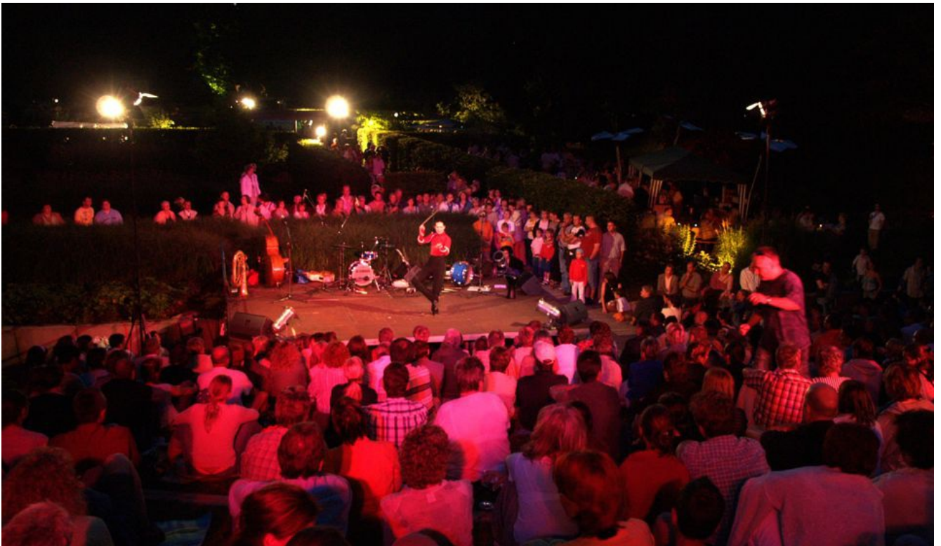
« Zurück Nordpark - Studierendenfest (Bild 8 von 15) » Vorwärts