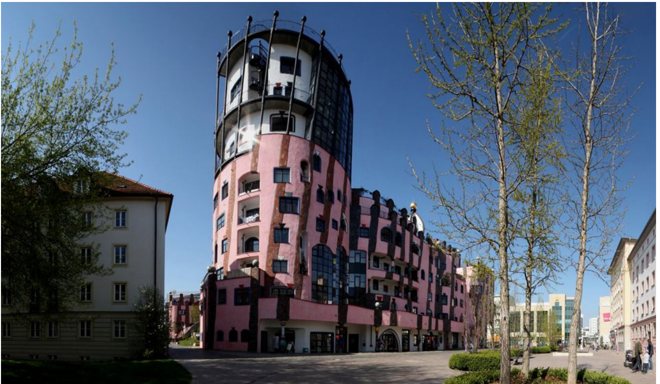
« Zurück Hundertwasserhaus (Bild 12 von 15) » Vorwärts