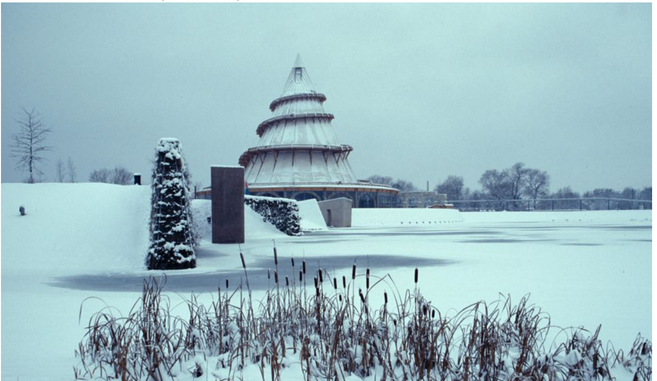
« ZurückJahrtausendturm im Elbauenpark (Bild 11 von 15) » Vorwärts