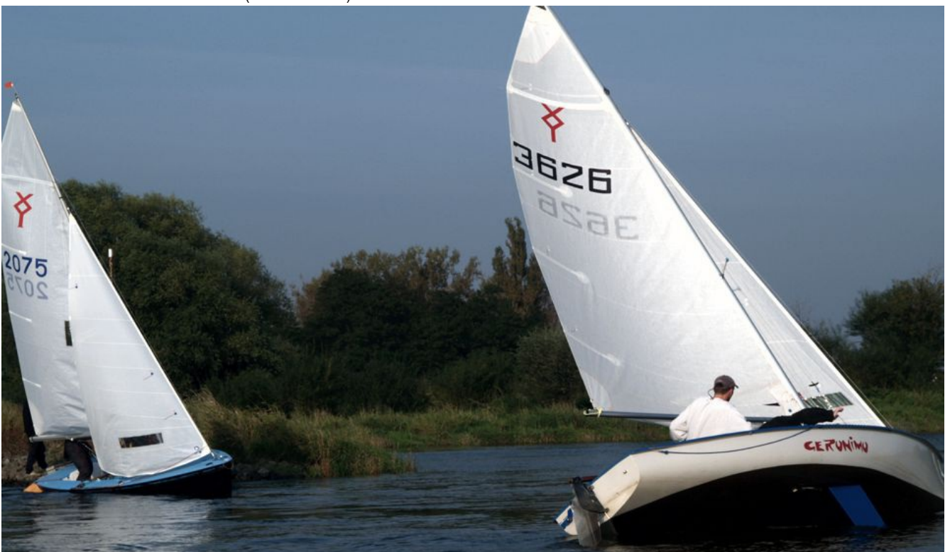
« Zurück Segeln auf der Elbe (Bild 5 von 15) » Vorwärts