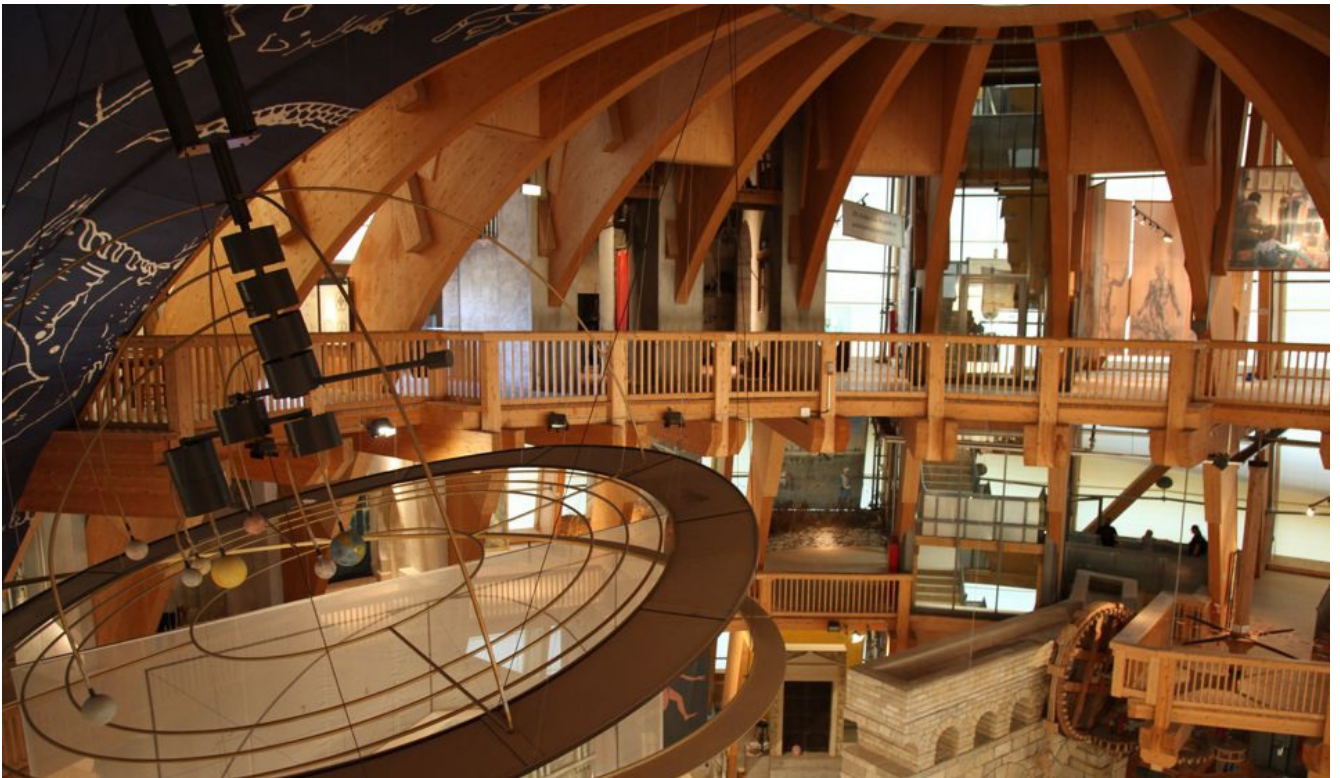
« ZurückIm Jahrtausendturm (Bild 10 von 15) » Vorwärts