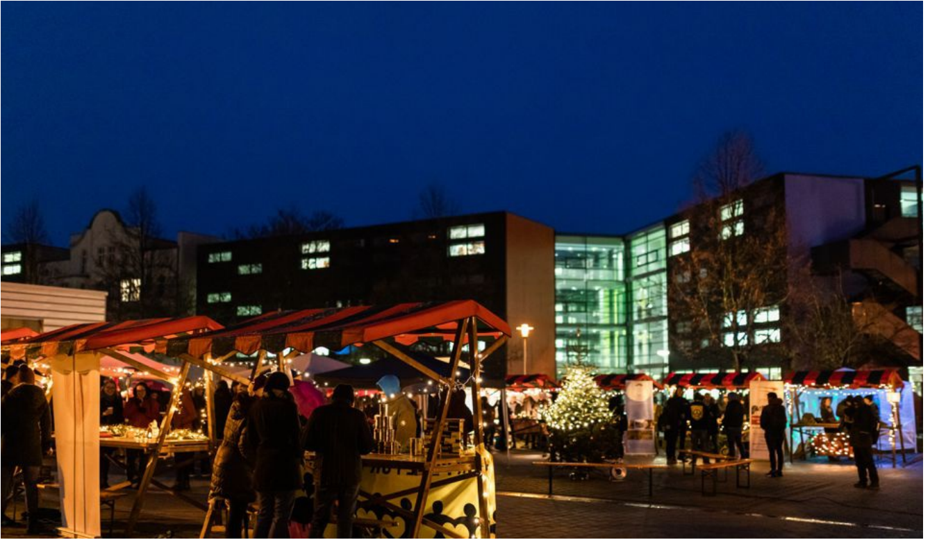
« Zurück Uni-Weihnachtsmarkt (Bild 14 von 15) » Vorwärts